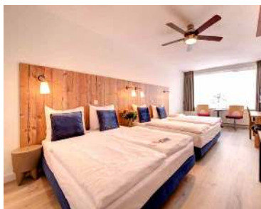
Family Room Large Spacious rooms for 2-5 people

Cheerful, homely, comfortable rooms | we are happy to take your luggage to your room | flat-screen TV | safe | roll-down shutters | free WiFi | bathroom with shower and toilet