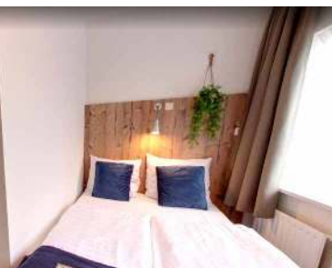
Double Room Small Cosy rooms for 1-2 people