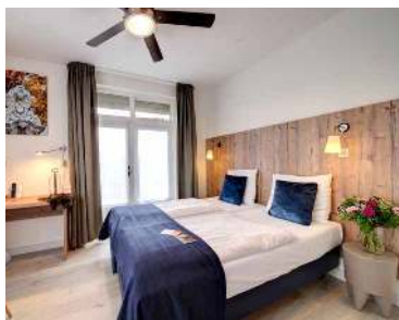
Double Room Comfortable rooms for 1-2 people