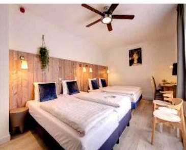
Family Room Comfortable rooms for 2-4 people