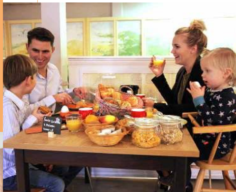
Enjoy a delicious breakfast together!